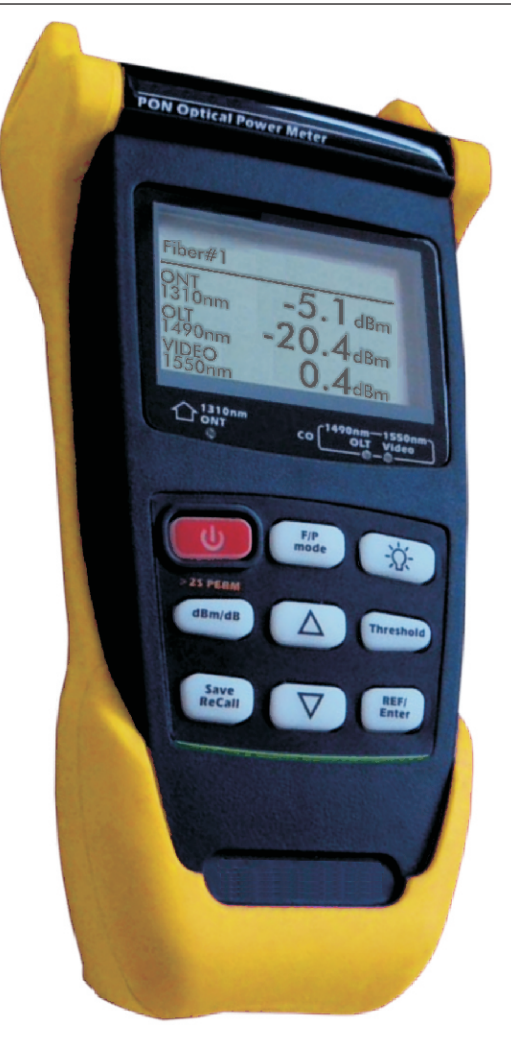
NOTICE: ENCLOSURE COLORS MAY VARY