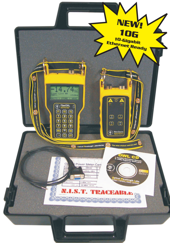
Connector styles or placement may vary from photo

Patch cables are available for an additional charge. Contact OWL for more information.