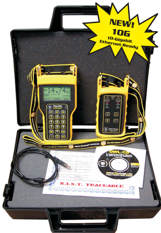
Connector styles or placement may vary from photo

Also supports 2 user-definable standards