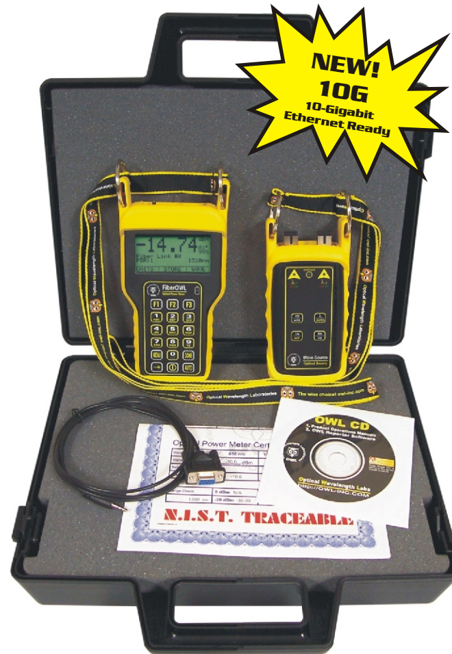
Connector styles or placement may vary from photo

Three connector options are available (ST, SC, and FC), and is upgradeable to include 1310 & 1550nm singlemode sources.